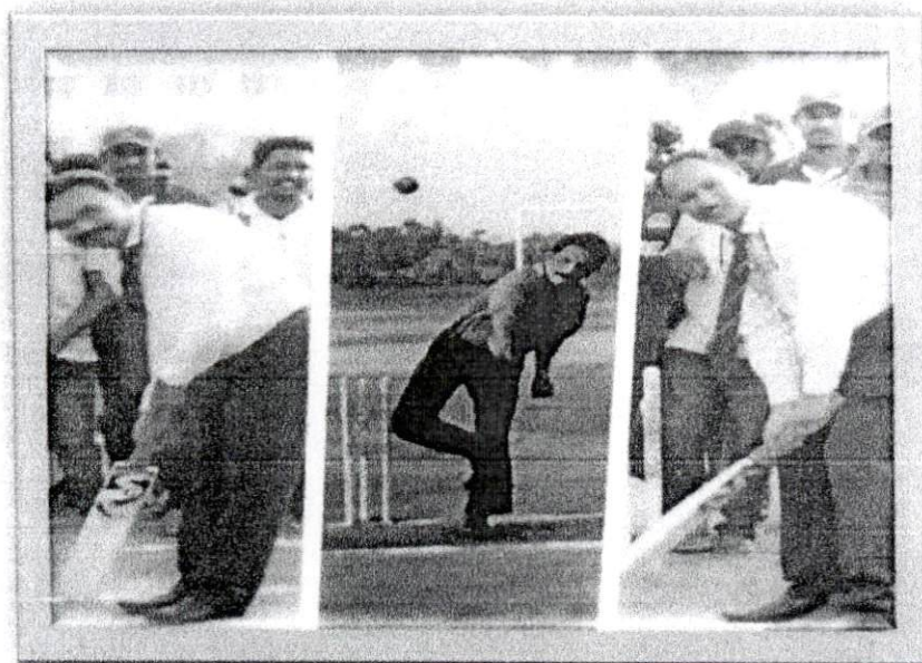
Guest Opening Ceremony